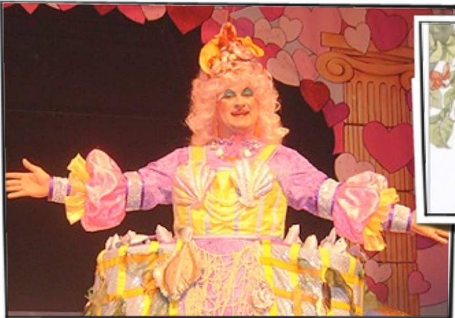
THE PICTURE ABOVE IS OF A TRADITIONAL PANTOMIME 'DAME'!